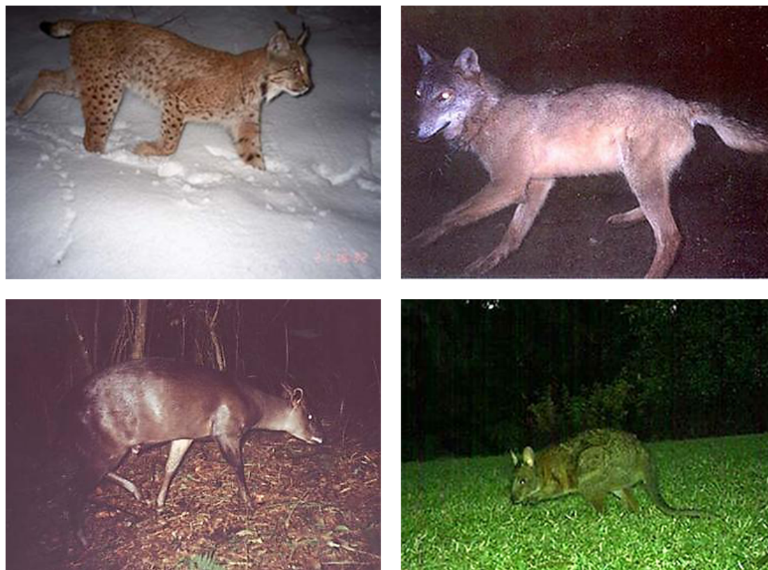
Figure 1 – Collage of camera trap images from around the world. Top left: Eurasian lynx, Lynx lynx , moving in snow in Switzerland and monitored with camera traps by KORA. Top right: a rare documentation of a wolf, Canis lupus , camera trapped in central Italy, with signs of hybridization with dog and bearing an iron snare on its neck. Bottom left: Abbott's duiker, Cephalophus spadix , a rare and threatened forest ungulate in Africa, endemic to a few sites Tanzania, whose first ever images in the wild were taken with camera traps. Bottom right: red necked pademelon, Thylogale thetis , a shy and forest-dwelling marsupial living in the eastern coastal region of Australia.